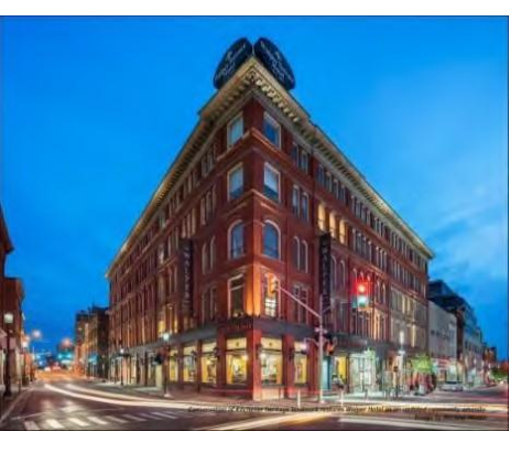
ACO Award Nominee Walper Hotel, Kitchener