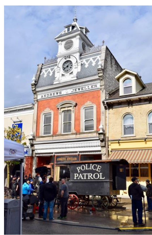
(above) Murdoch Mysteries filming in St. Marys