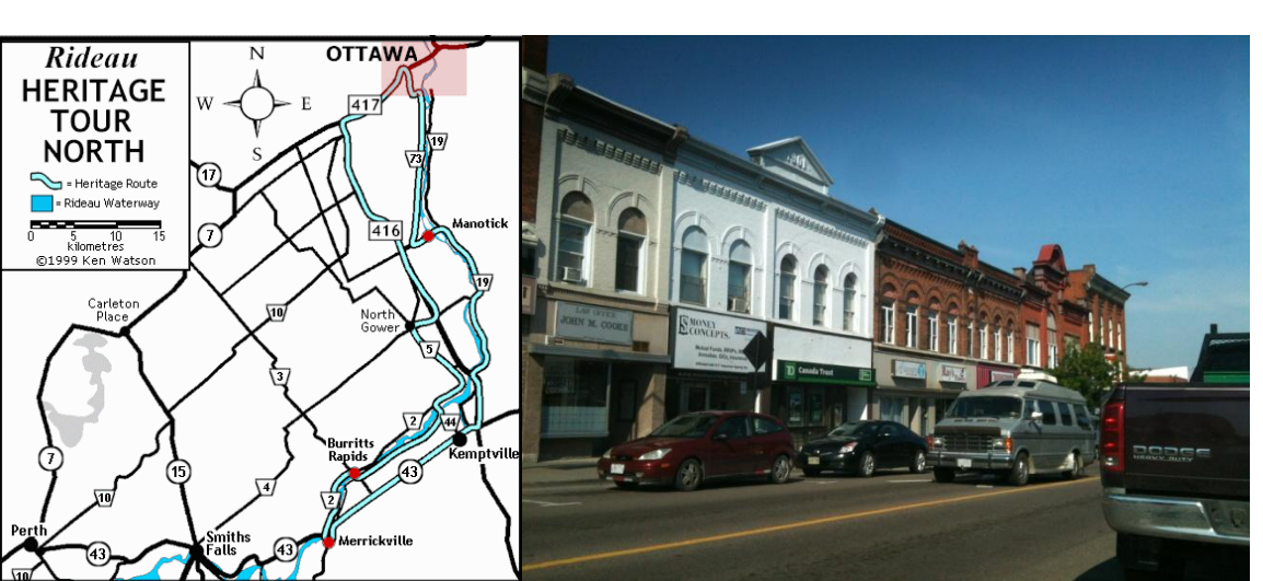
Renfrew, Every Ontario town, city, village has its own rich story to tell