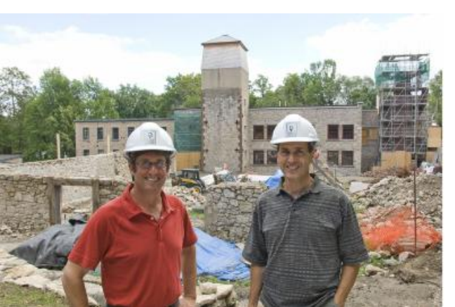
(Left) Seaton Group investment in Alton Mill inspired investment in nearby properties. A Federal grant (CHPIF) provided critical seed monies and advice.

Firms with less than 20 employees create 77% of all new jobs (Source: Innovation, Science and Economic Development Canada, 2018). Many of these start in older, more affordable buildings that serve communities as creative hubs, often the result of private investment in older buildings on Main Street and former industrial areas.