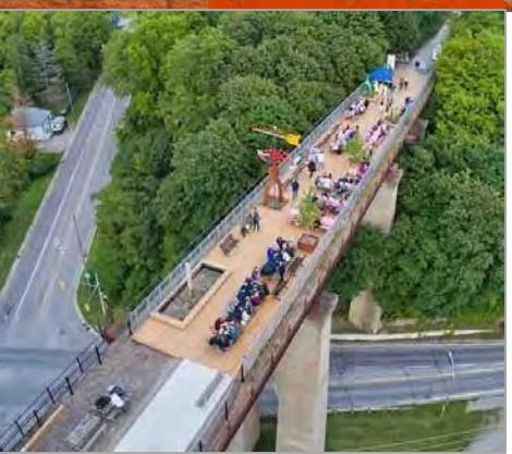
ACO Adaptive Reuse Award Winner- St. Thomas Elevated Park