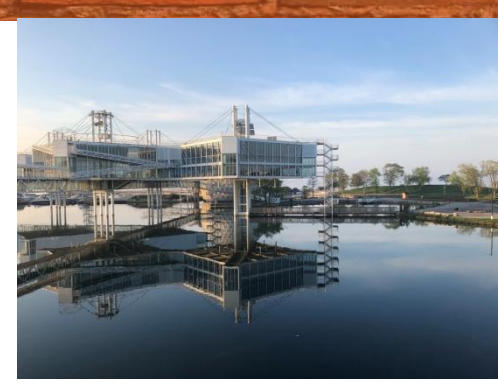
The Future of Ontario Place International collaboration between ACO, World Monuments Fund 2020 Watch List and U of T Daniels Faculty of Architecture Landscape Design, Toronto, on https://futureofontarioplace.org/