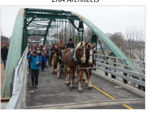
ACO Award Nominee, Blackfriars Bridge Restoration Team, London