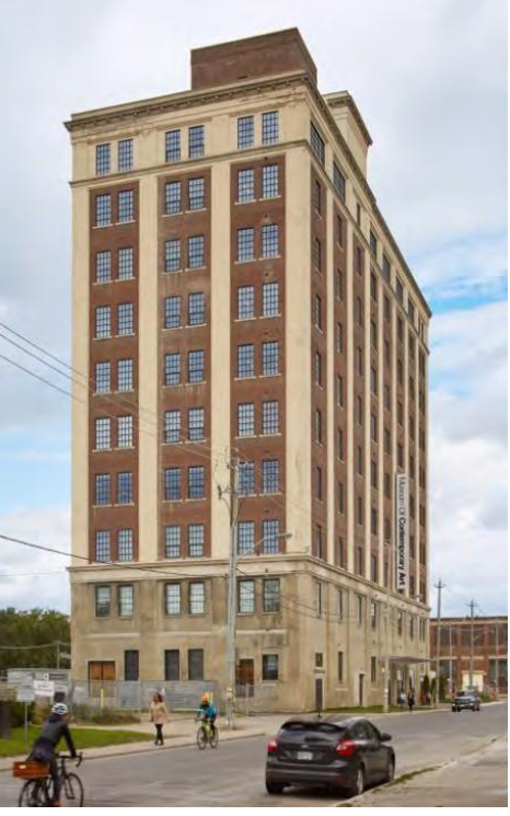
Once abandoned, Tower Automotive, Toronto was repurposed as the Museum of Contemporary Art and a hub for software and creative enterprises.