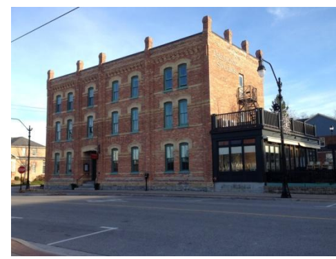
Tremont Hotel, Collingwood , former hotel rehabilitated for restaurant, housing and studio space by Rick and Anke Lex, below their conversion of former newspaper plant for boutiques