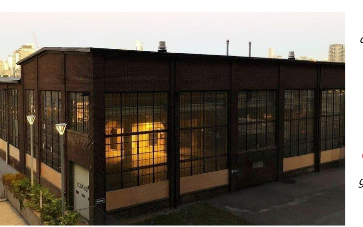
(Left) Economic and cultural regeneration opportunity will be lost if demolition of Dominion Foundry continues in Toronto, photo Friends of the Foundry (Rigth )Paisley Hotel languishing, government stimulus could make the difference