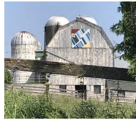
ACO Award Winner, Port Hope Quilt Trail

Arts and Heritage Access and Availability Survey. Canada Council for the Arts (2016-2017) http://epe.lac-bac.gc.ca/100/200/301/pwgsc-tpsgc/por-ef/canadian_heritage/2017/051-16-e/report.pdf