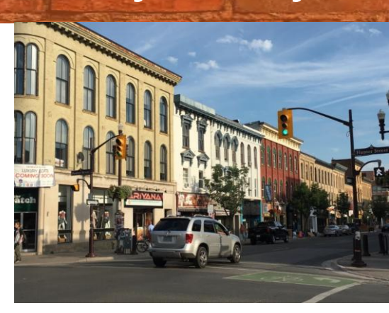
Peterborough's Heritage Property Tax Rebate Program has revived downtown