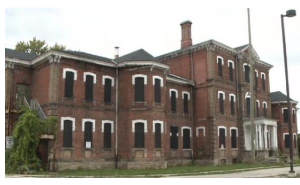
Century Manor, Hamilton