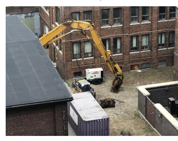
Dominion Foundry, January 21, 2021