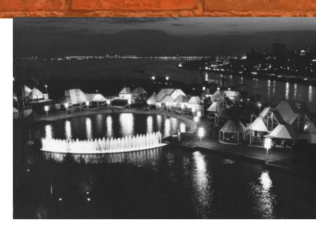
Ontario Place Village, 1979