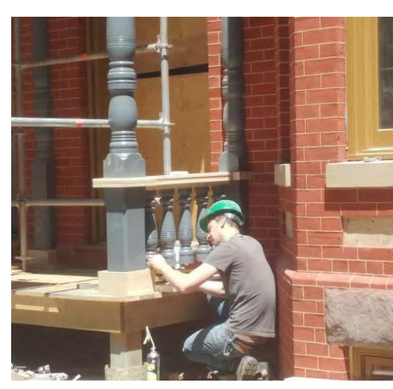
Rebuilding the porch at 62-64 Charles St. Toronto, ERA Architects