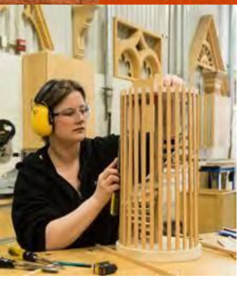
Heritage carpentry student, Algonquin College, Perth